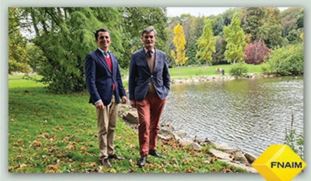
•At the head office, a solid team of collaborators.

•Partners, men with a lot of field experience, and member of the FNAIM (France's chamber of chartered estate agents).